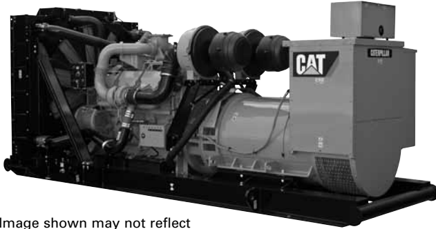
Image shown may not reflect actual engine configuration