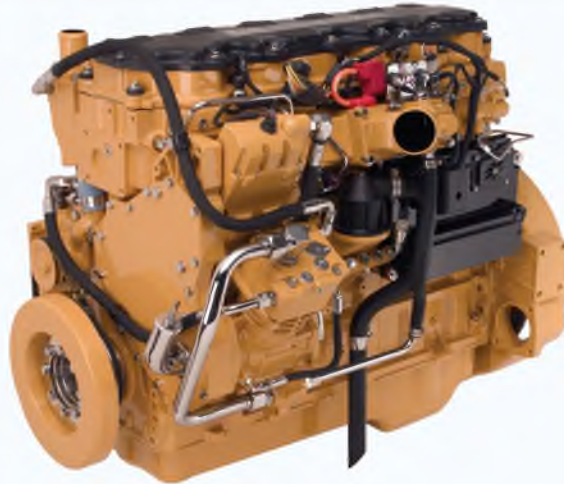
Image shown may not reflect actual engine