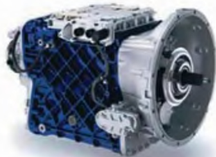
■ Volvo I-Shift

The gearboxes are factory-prepared for installation of a compact retarder, power take-off, emergency power-steering pump, oil cooler and oil temperature monitoring.